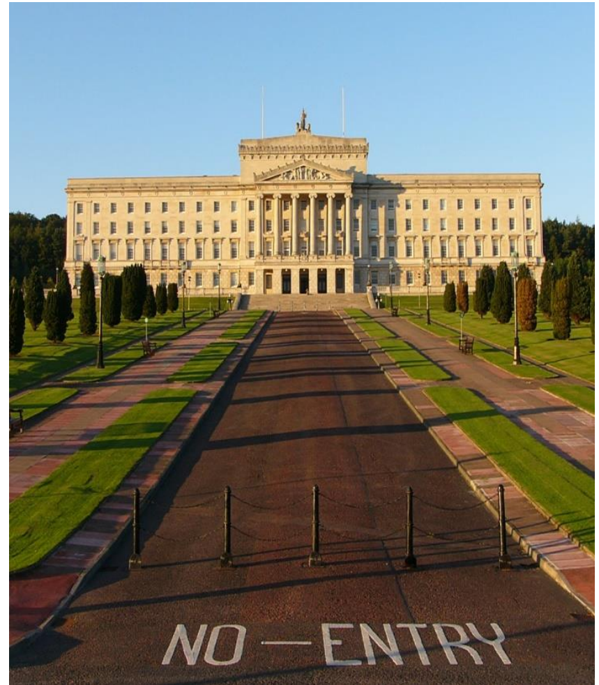
(Cropped with apologies to Northern Irish Colleagues

In this year as Pioneers for OGP we have a unique opportunity to put Scotland at the forefront of global openness and transparency and take real steps to build on our history of progressive, rights based government.